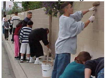
Building Vital and Safe Neighborhoods

• Our Energy and Environmental Services programs offer utility assistance and home repair services to low income families and weatherization services to lower energy burdens to help low-income families reduce their utilities bills that helps over to 3,000 families each year