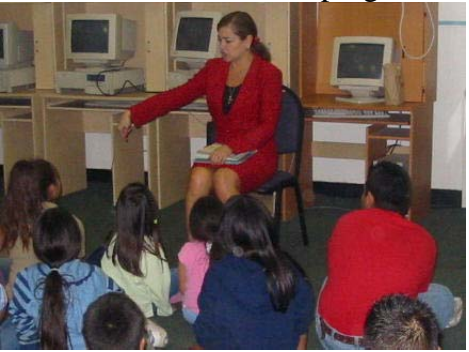
Strengthening and Supporting Families

Helping Kids Succeed provides a safe and nurturing environment for school age children to participate in after school programs that provide nutrition education and meals, engage them in physical activities that build strong bodies and minds, and provide trained tutors to help students succeed in school. For High School age students we provide pathways to college that get students planning for college and informing them of financial aid and other programs.